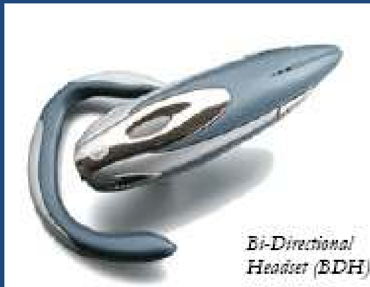
Bi-Directional Headset (BDH)