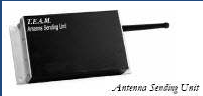
Antenna Sending Unit